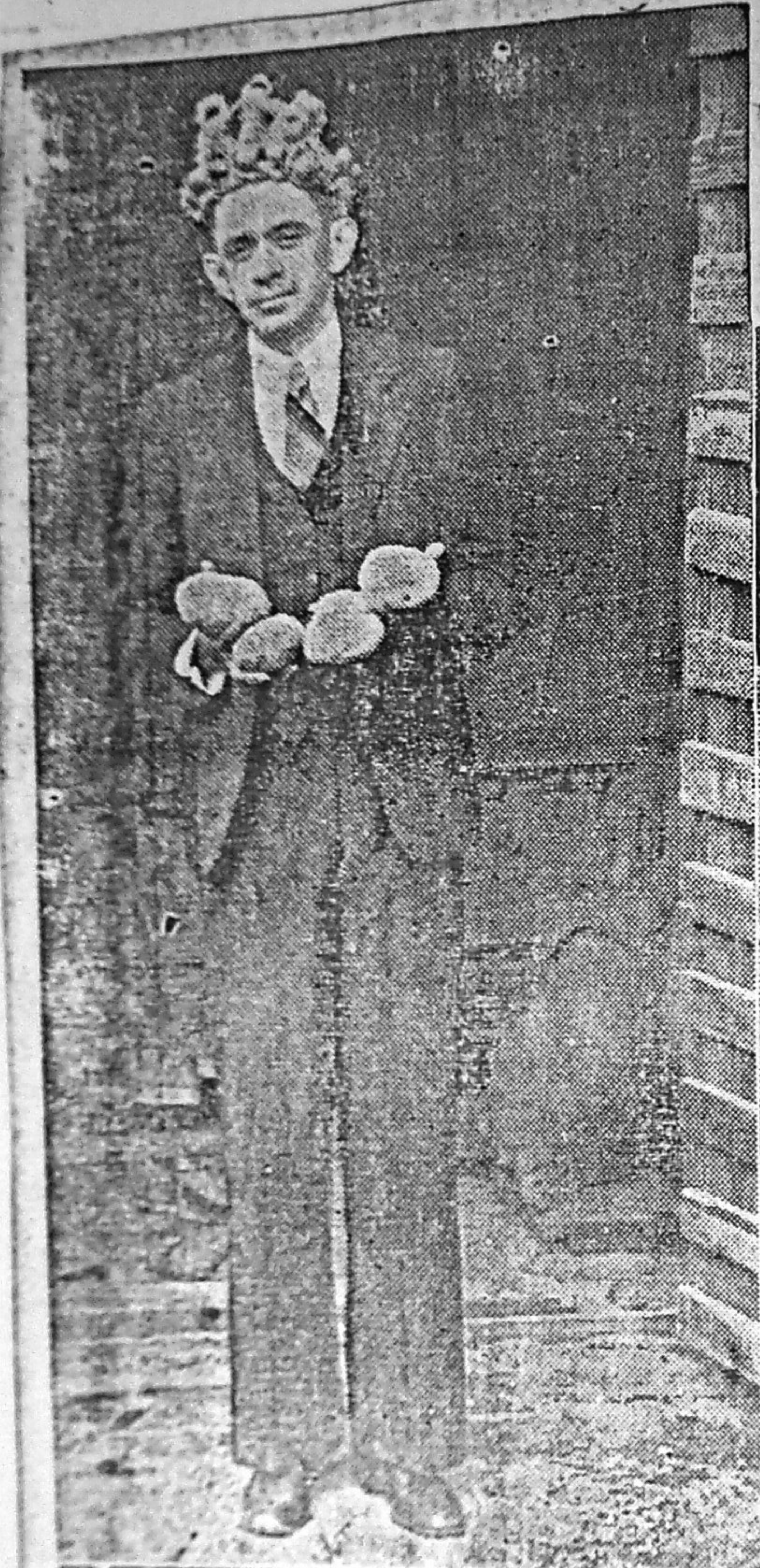
Efficient Production And Wise Marketing Boost Potato Profits